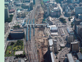
Area surrounding Toyama Station

The Hokuriku Shinkansen line, when completed, will contribute remarkably to the development of those areas along its length, and help ease the burden on the Tokaido Shinkansen. Therefore, it is necessary to urgently conduct its development as a national project to form a land axis along the Japan Sea coast. All the sections in Toyama Prefecture have already been launched with the aim of initiating the service by the end of 2014.