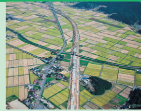
Approx. 26 km between Atsumi and Tsuruoka

This expressway stretches between Niigata City and Aomori City, via Tsuruoka City, Sakata City and Akita City. The Shonai area of Yamagata Prefecture is rich in natural and tourism resources, and famous as the location for the movie "Okuribito." When this expressway is completed, there will be an increase in the number of nonresidents flowing into this area. The result of this should see revitalization of the surrounding local areas, through further tourism promotion and expansion of sales routes for local products, such as "Tsu yahime," a new rice brand from Yamagata Prefecture. (Scheduled to open in 2011)